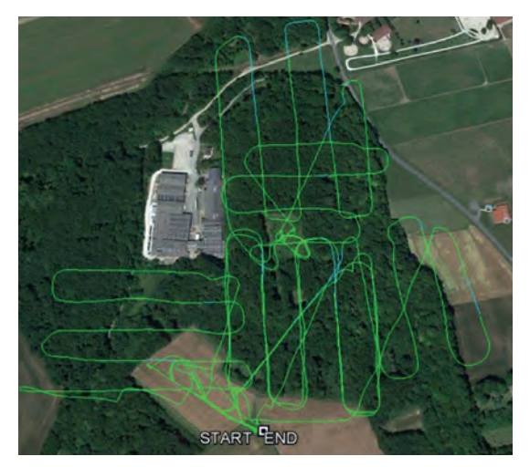
▲ Figure 2: UAS flight lines.