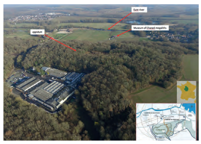
▲ Figure 1: Overview and location of 'Caesar's Camp' oppidum site.

A thorough topographical survey of the site had never been carried out due to the dense tree cover. Only airborne Lidar could be used, and up until recently such surveys were very costly due to the use of a plane or helicopter. CAEL asked AIRd'ECO-drone to carry out a drone-based Lidar survey to