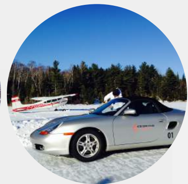
PLANE ON SKIS

Come experience the true snowy winter in the heart of Quebec.