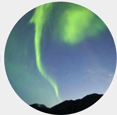
NORTHERN LIGHTS YUKON

Canadians know how to make the most of winter. No matter the conditions or location, they don't hesitate to go out and enjoy the fresh, light, fluffy snow. That is the way to experience the wild nature and beautiful scenery that surrounds them.