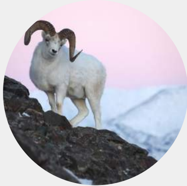
DALL SHEEP -KLUANE NATIONAL PARK