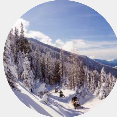
SNOWMOBILE - WHISTLER