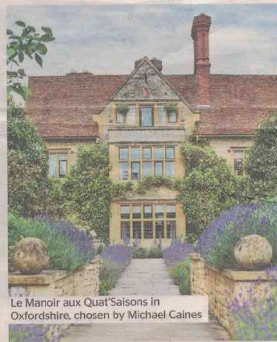
Le Manoir aux Quat'Saisons in Oxfordshire, chosen by Michael Caines

breakfast in the Hôtel du Palais feels like being safely on the bridge of the Titanic with the waves of the Atlantic breaking over the cliff-top and the lighthouse bravely flashing in the distance."